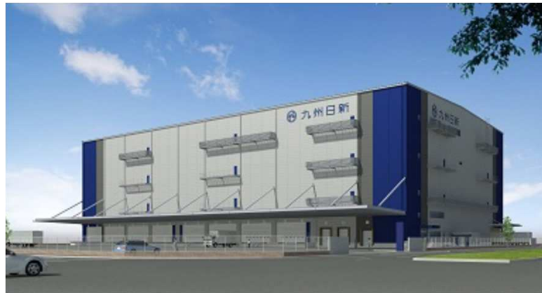
Rendering of Fukuoka Island City Warehouse

Recognized for such efforts toward environmental conservation, the Group has been authorized to receive a subsidy from the Ministry of the Environment when it constructs a new warehouse.