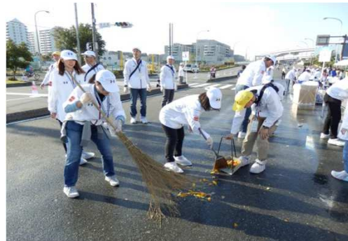
Cleanup is also an important role