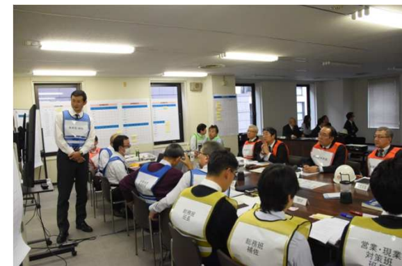
Implemented a training on making decisions in a situation that changes minute-by-minute