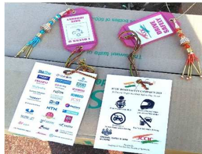
Traffic safety cards

We will continue to conduct activities that aid the local development of India.