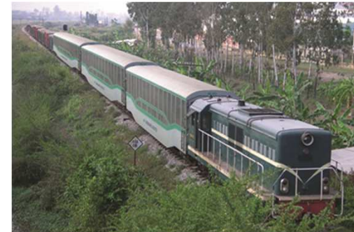
Operation of block train by NR Greenlines*

Hanoi and Ho Chi Minh City are approximately 1,700 km apart, equivalent to the distance between Hachinohe and Fukuoka