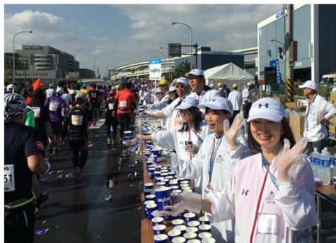
Providing drinks at the water station

We also want to loudly cheer for runners in the autumn marathon as volunteers who support civic events in our community of Yokohama.