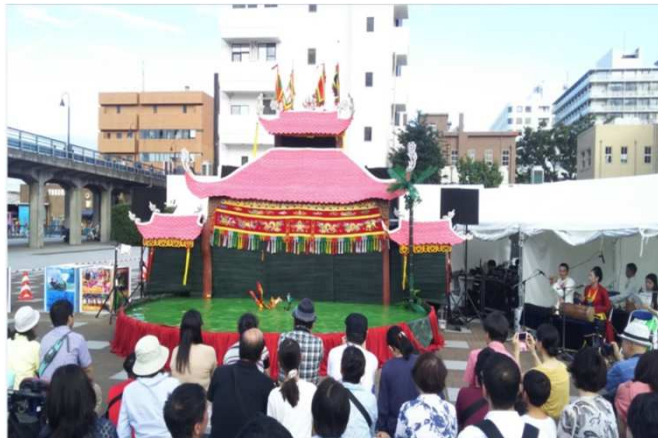
Water Puppet Theater, one of the traditional performing arts in Vietnam

The Group co-sponsored the Vietnam Festa in Kanagawa 2018 held on September 7 to 9. We transported the large props of the Water Puppet Theater for free, as we did in 2017. The weather was good on the day of the event, and many visitors watched the puppet play, deeping the cultural exchange between Japan and Vietnam. We hope that both countries will continue to strengthen friendship in a range of areas and work toward the 50th anniversary of the establishment of diplomatic relations.