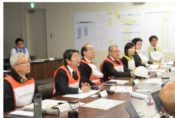
Scene of the initial response training

In January 2019, the Group conducted an initial response training for the emergency headquarters based on the assumption of a Tokyo inland earthquake. The Group will continue to fulfill its mission as a logistics company, part of the social infrastructure, by establishing effective business continuity management (BCM) based on the PDCA method during peacetime, including the implementation of training sessions based on a variety of scenarios, the development of MCA wireless communication devices essential for initial contact at the time of a disaster, the enhancement of safety conformation systems, and the development of stockpiles for disasters.