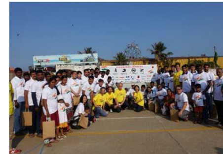
Participants in a traffic safety event