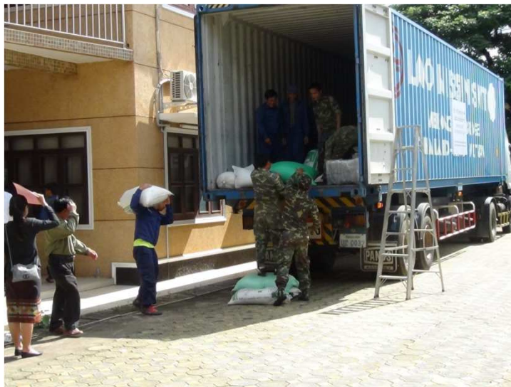
Loading relief supplies into a truck

More than 260,000 people were victims, and many were forced to live in emergency shelters. The company completed the delivery by proceeding with the work so that the goods would be delivered as soon as possible.