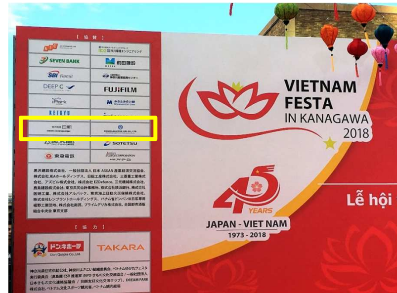
Event co-sponsored by Nissin Corporation and Nissin Logistics (VN) (established in 2006)