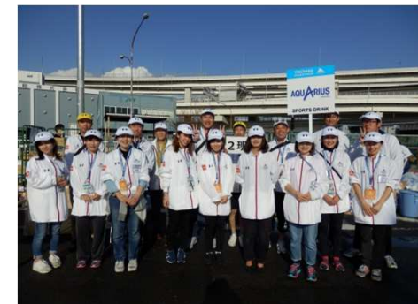
Members of the company