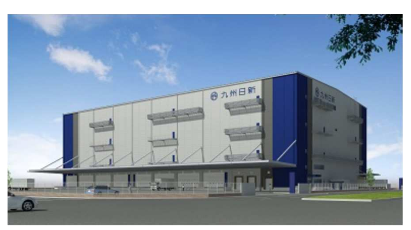
Rendering of Fukuoka Island City Warehouse

Recognized for such efforts toward environmental conservation, the Group has been authorized to receive a subsidy from the Ministry of the Environment when it constructs a new warehouse.