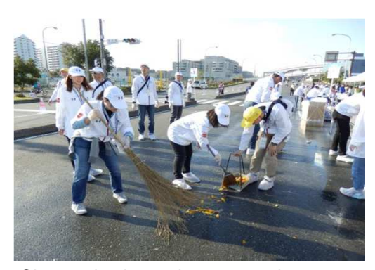
Cleanup is also an important role