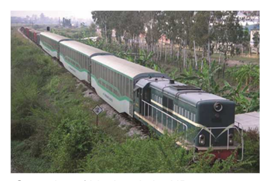
Operation of block train by NR Greenlines*

NR Greenlines Logistics Co., Ltd. Joint venture company between Nissin and RATRACO, a subsidiary of Vietnam Railways, established in 2008