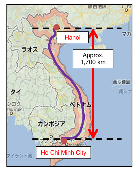
Hanoi and Ho Chi Minh City are approximately 1,700 km apart, equivalent to the distance between Hachinohe and Fukuoka

* Calculated based on the calculation sheet of energy usage and CO<sub>2</sub> emissions of Japan Freight Railway Company.