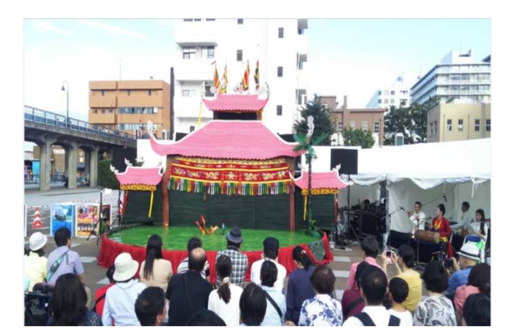
Water Puppet Theater, one of the traditional performing arts in Vietnam

We hope that both countries will continue to strengthen friendship in a range of areas and work toward the 50th anniversary of the establishment of diplomatic relations.