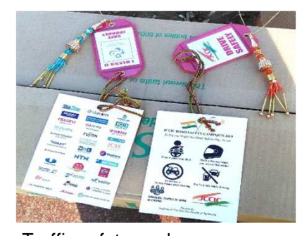
Traffic safety cards

We will continue to conduct activities that aid the local development of India.