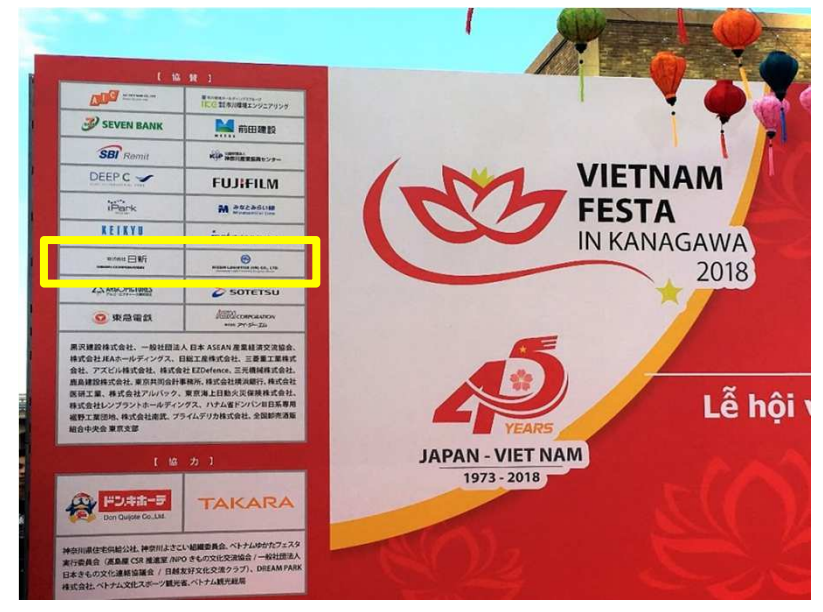
Event co-sponsored by Nissin Corporation and Nissin Logistics (VN) (established in 2006)